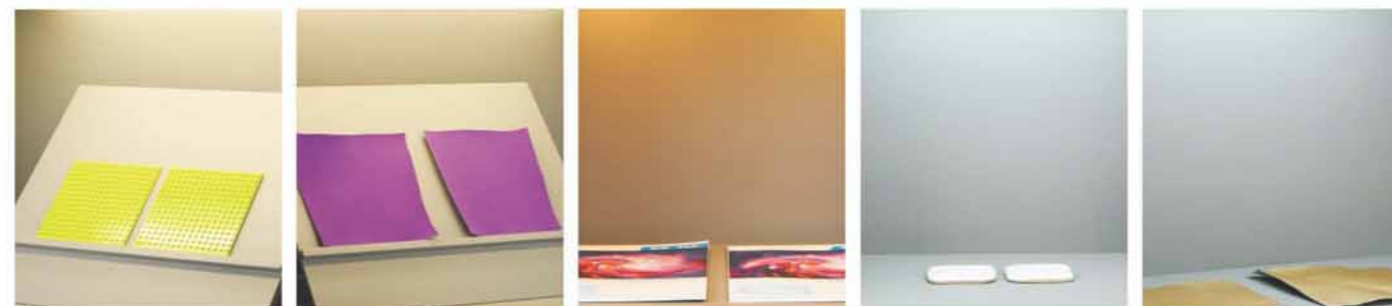
Plastic Textile Print Ceramics leather